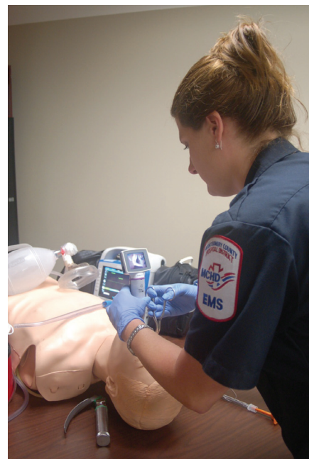
An MCHD paramedic demonstrates performing FBAO removal with video laryngoscopy.

To assure the successful deployment of video laryngoscopy, EMS systems should ensure and facilitate initial didactic and hands-on training, verification of skills,